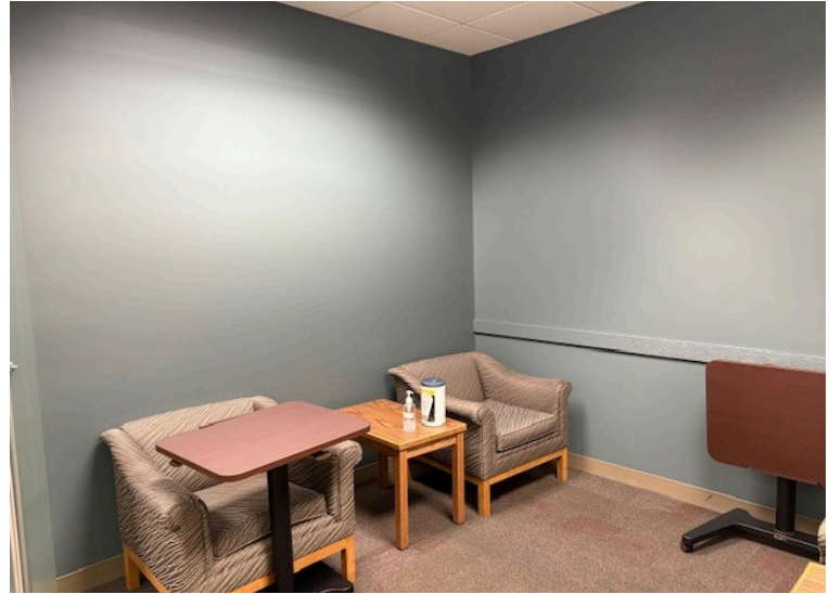
Portable tables can be moved around the space to accommodate pumping or breastfeeding.

“One mother reported that she is able to remain at the library longer to study because of the ability to pump in the provided space.”